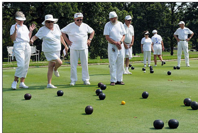
A photo from way back. Can you identify any players.